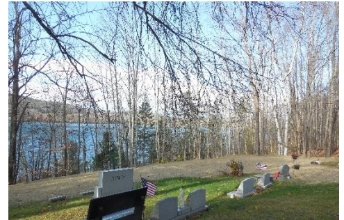
The expansion in the West Section