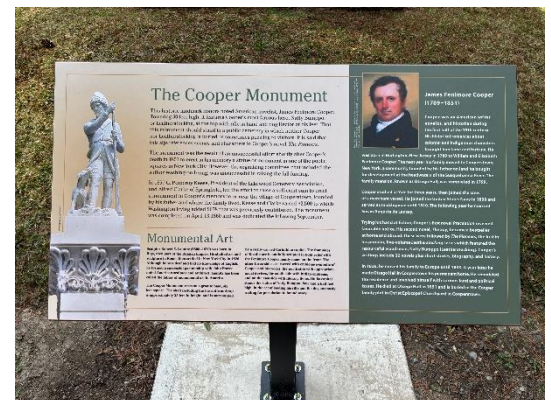
The new Cooper Monument sign