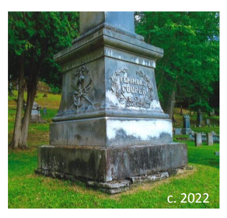
James Fenimore Cooper Monument Preservation

The preservation and restoration of monuments, gravestones and stone steps is an important part of the mission of the Lakewood Cemetery Association. Projects for Summer 2022 will include cleaning of monuments, in particular the Cooper Monument, a special landmark and focal point in the Cemetery. Humphrey Memorials Inc. of Herkimer will power wash the 30' marble monument following environmental guidelines. A brief history of this memorial to James Fenimore Cooper, erected in 1860, includes a detailed description of the sculptured features on the landmark.