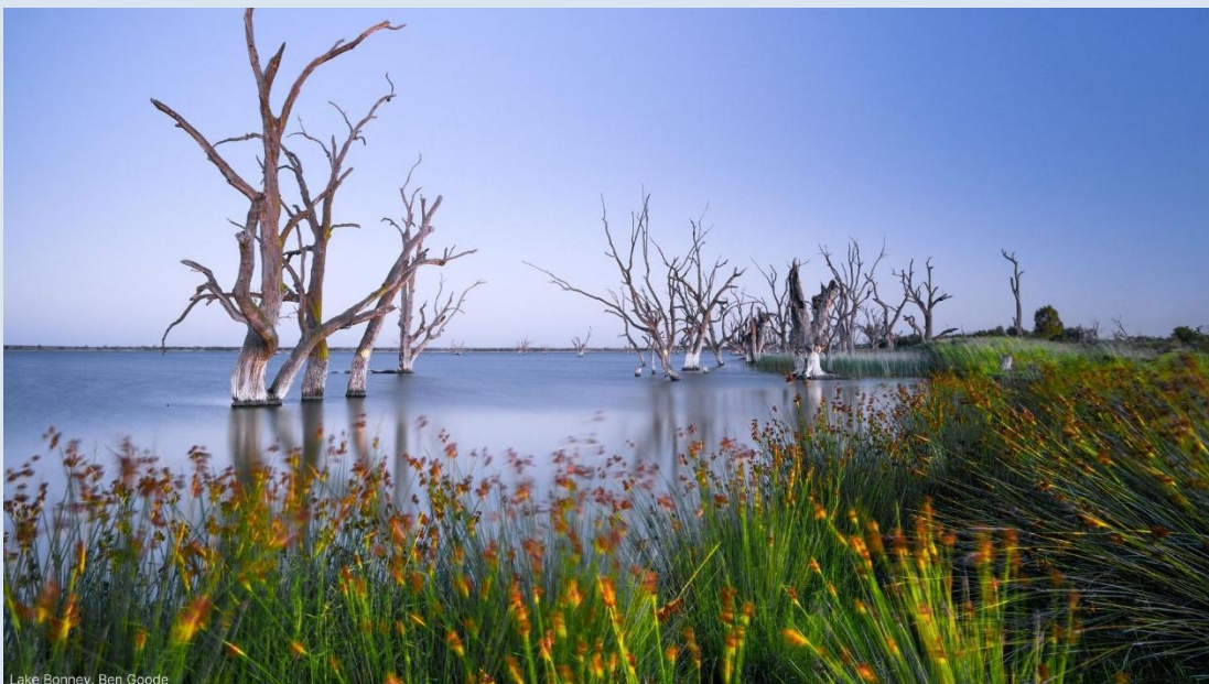
Lake Bonney, Ben Goode