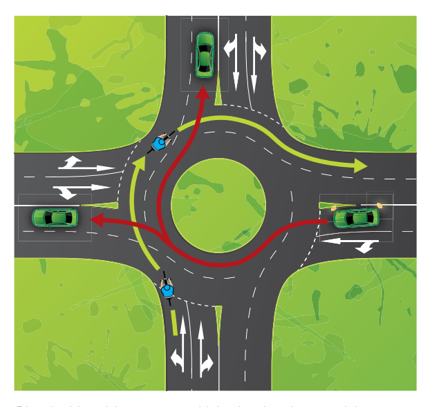
Bicycle rider giving way to vehicles leaving the roundabout

Like all motorists entering a roundabout, bicycle riders must give way to vehicles already using the roundabout and should look out for vehicles approaching the roundabout from the right. You may turn right from either lane of a multi-lane roundabout. If you are riding in the left lane, you must give way to any vehicle leaving the roundabout.