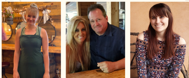
Meet the Team