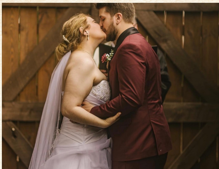
The Phoenix Coalition

Our second most popular package! The Venue is yours ANY one day! 10 am - 11 pm All inclusive & stress free!