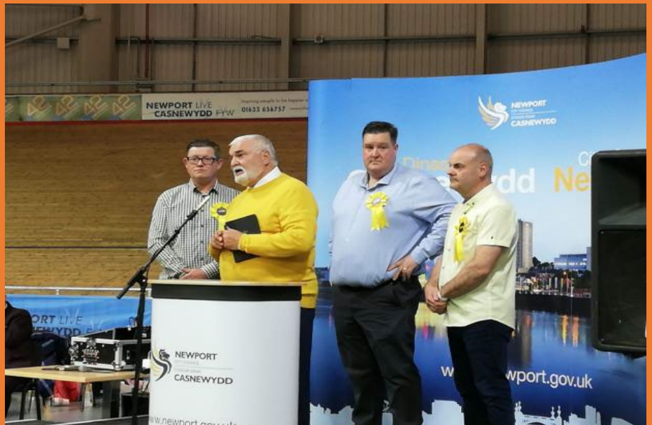
Independent Candidates celebrate victory at the local council elections, 6th May

It's been a really busy month for all of us throughout May. We had the initial AGM where we were sworn in and welcomed as your councillors, we have also had lots of training courses to attend, and new equipment to get to grips with. We have also had lots of work to do, see page 2 for a breakdown of some of things we've been involved in.