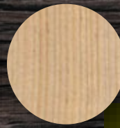
Doug Fir (Vertical Grain)