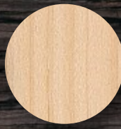
Eastern White Pine