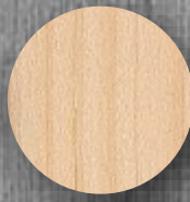
Eastern White Pine