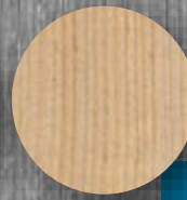
Doug Fir (Vertical Grain)