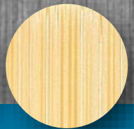
Natural Narrow Grain Bamboo