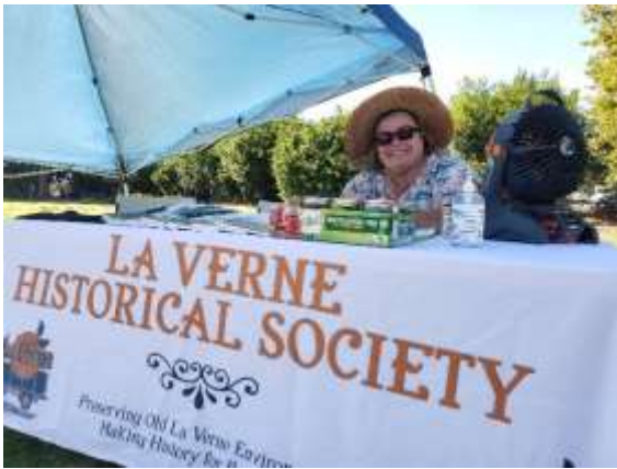
The LVHS unfurls its new table banner on the August 3 National Night Out in Las Flores park

On Tuesday, August 3, the LVHS participated in La Verne's National Night Out. It was a treat to connect in person with community members. Our organization netted over $100 in t-shirt, book, and jelly sales toward restoration of the 1938 International truck. Best of all, it was re-assuring to see people enjoying themselves after a long stretch of social isolation. Unfortunately, the coronavirus is not done with us, so be careful and stay safe. Soon enough we'll be back in business.