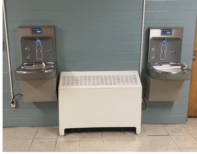
Water bottle filling stations