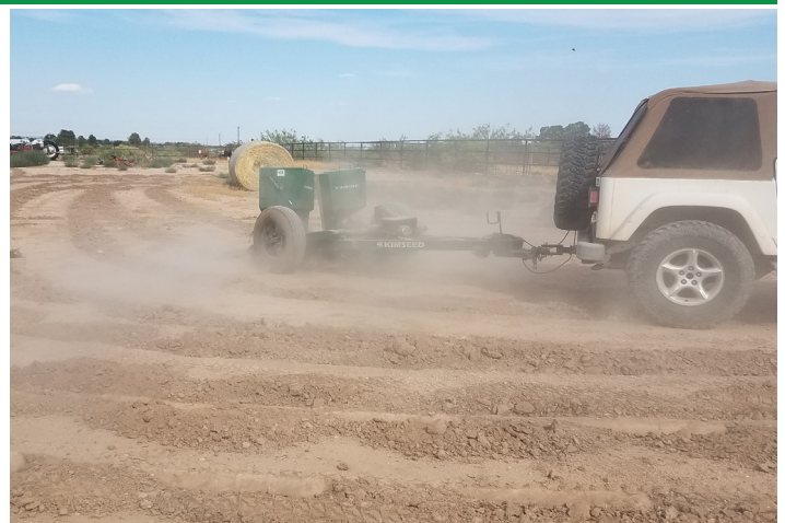
Healthy Soils Program Grant: Restoring Urban Interface to Native New Mexico Grassland- Integrating livestock and reseeding with native grasses