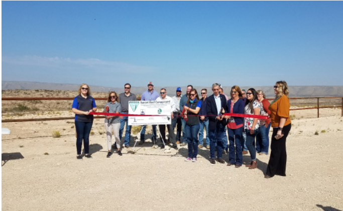
Ribbon Cutting at Sunset Reef Campground

One of the projects that CSWCD worked on with partners at the BLM and in the oilfield this last year was the Sunset Reef Campground. This project took an abandoned well site on BLM lands and converted it to 5 RV and 6 tent capacity dry campground. It has overhead shelters and ADA picnic tables at each camping spot. While there is no water or electricity, there is a vault type restroom. The view is amazing! And is remarkably well hidden from the highway even though it is just off of US 62/180 and Washington Ranch Rd.