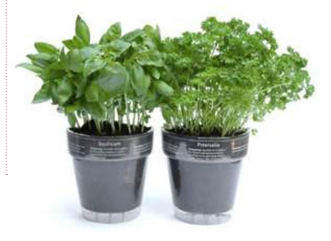
Culinary Herb Guide

Dress fresh rosemary with steamed red potatoes and peas or a stir fried mixture of zucchini and summer squash. Rosemary has a tea like aroma and a piney flavor. Crush the leaves by hand or with a mortar and pestle before using.