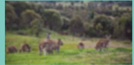
Blurry or cloudy vision from cataract