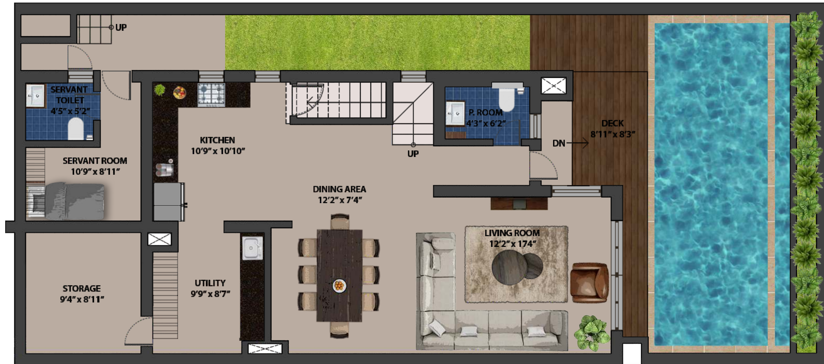
Lower Ground Floor Plan