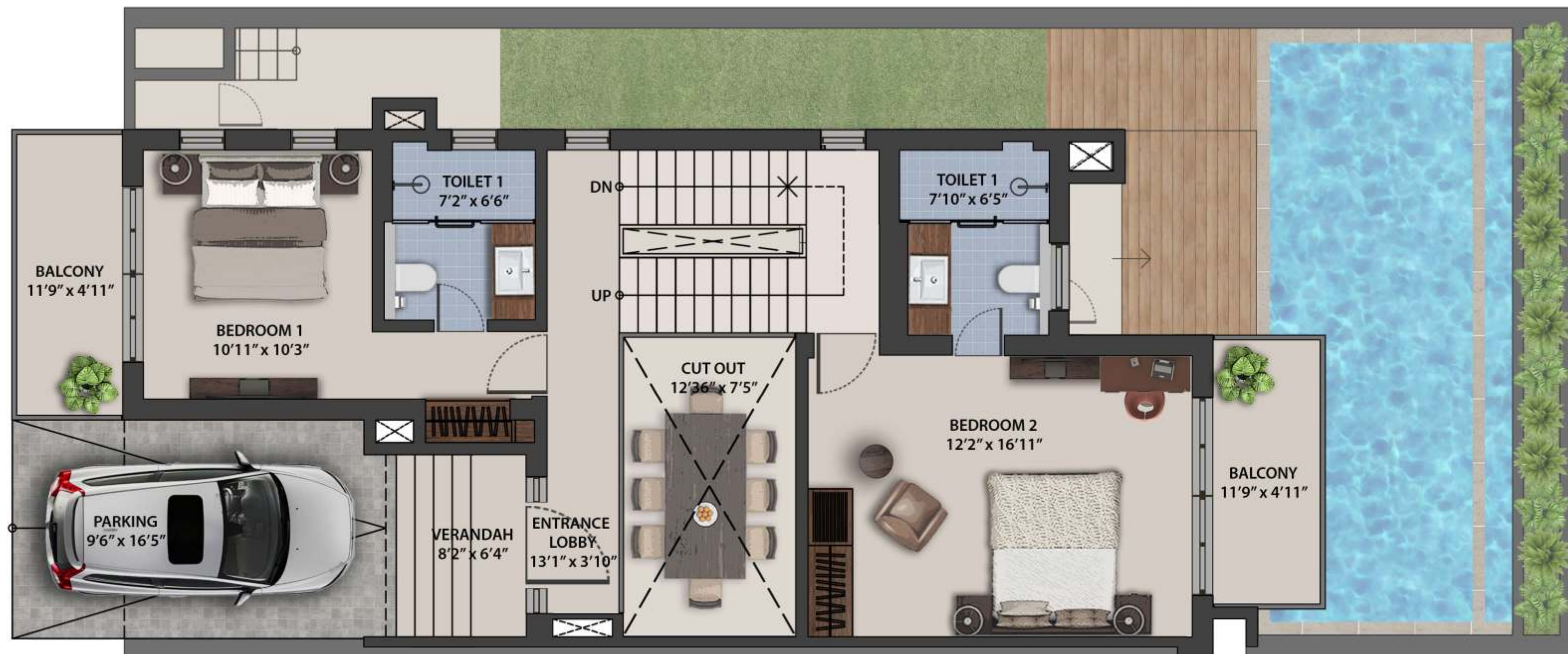
Upper Ground Floor Plan