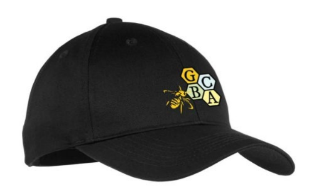
HomeTown Threads of North Olmstead is the source! Order Your GCBA Swag Here