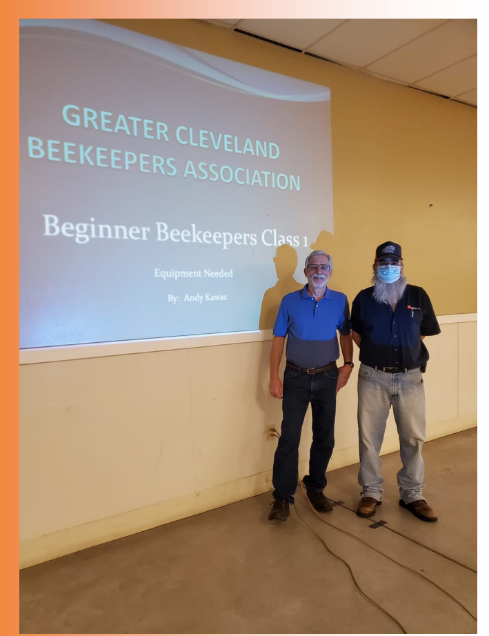
The 2022 Beginner Beekeeping Class Begin in February