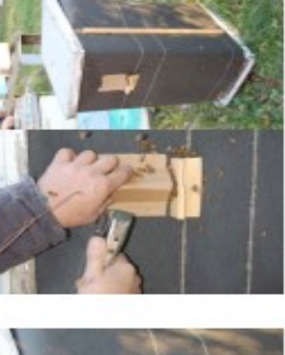
Optional. You can also make a little wind