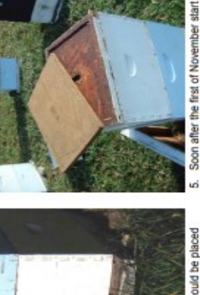
The entrance reducer should be placed with the 3" space facing up.