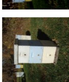
bodies with most of the honey toward the top. The holes in the bottom two boxes should be closed. The colony should be in 3 deep hive