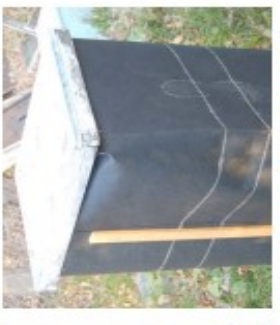
cover down over the sides; you want it to be up a little so the air can evaporate the moisture from the moisture board. Be sure to put a rock on top to keep the wind from blowing the lid off.