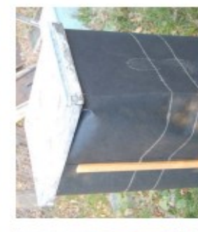
10. Put the cover on top. Do not push the