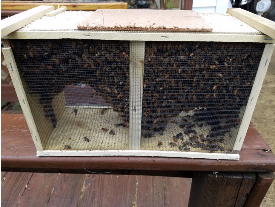
Package of Bees.