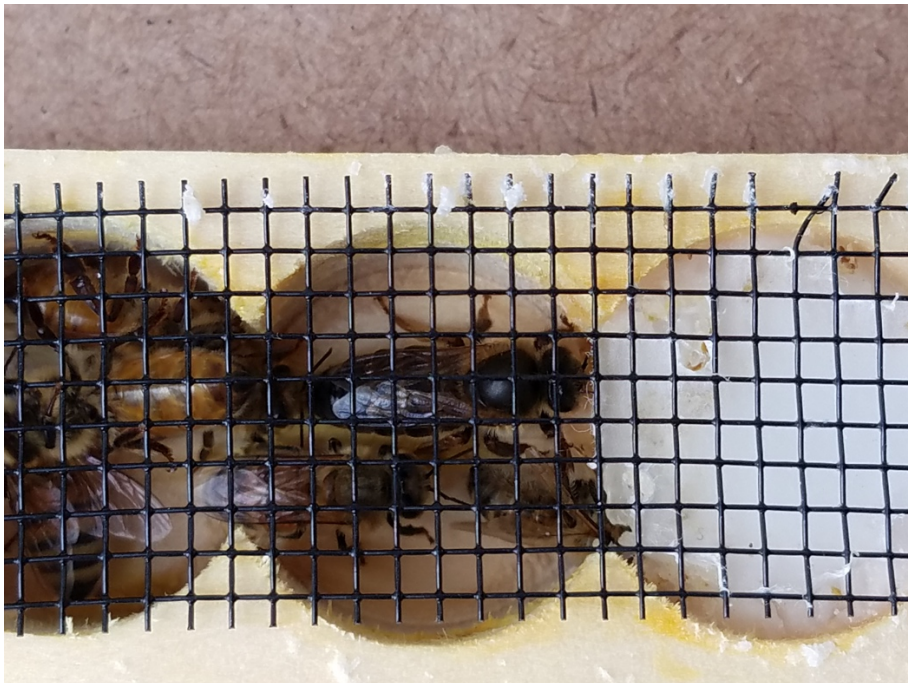
Russian Hybrid queen

with attendant bees and candy in a queen cage.