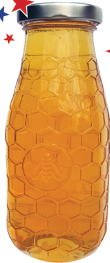
Glass & Plastic Containers