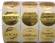
Custom & Standard Labels

Queen Right Colonies, Ltd. 43655 State Route 162 Spencer, Ohio 44275