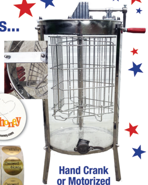
Hand Crank or Motorized Extractors