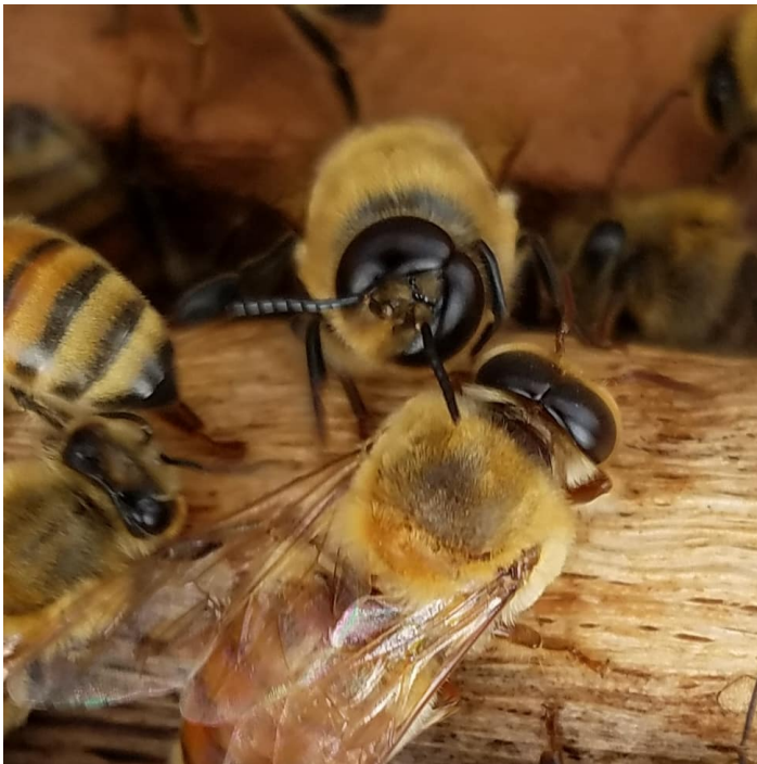
My what big eyes you have!! Drones