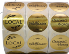
Custom & Standard Labels

Queen Right Colonies, Ltd. 43655 State Route 162 Spencer, Ohio 44275