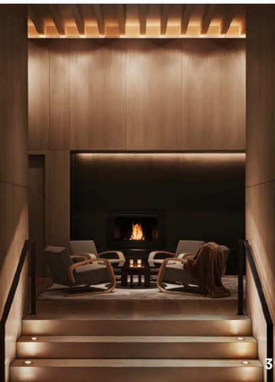
3. Modernist-inspired chairs in oatmeal tones cozy up to the lobby's 30-foot-long, hand-forged blackened steel fireplace.