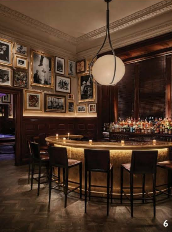
5. Vintage photography lines the walls above the wainscoting in the sapphire-toned dining room.