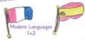
Modern Languages 1+2