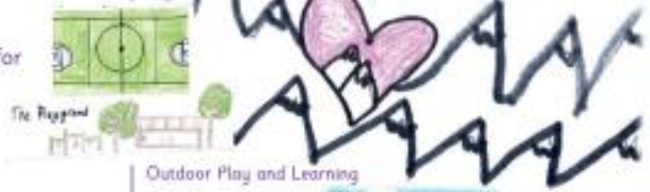
Outdoor Play and Learning

Always Learning Always Growing Always Positive