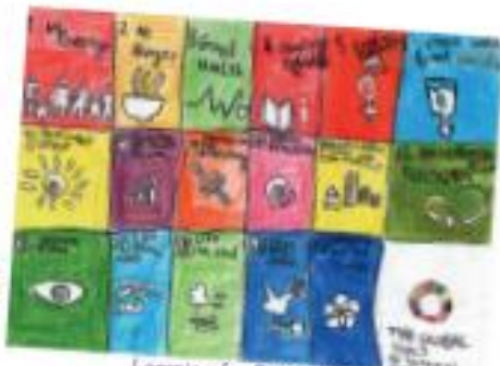
Learning for Sustainability