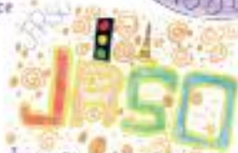
Junior Road Safety Officers