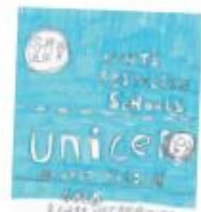
Gold Rights Respecting School

Always Learning Always Growing Always Positive