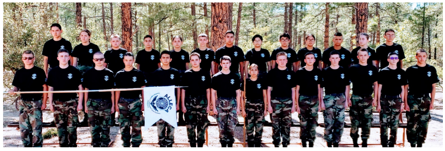
ALLECA Graduating Class 2019