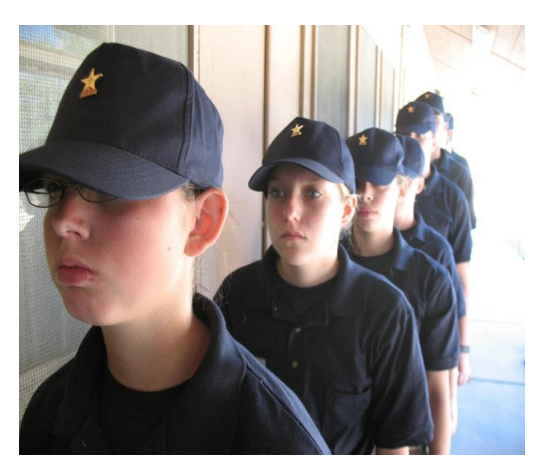
Single File Line