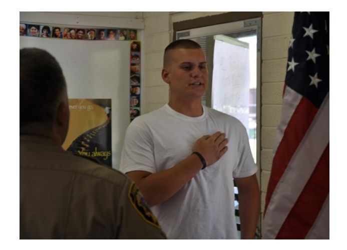
Pledge of Allegiance to the Flag when Reporting In