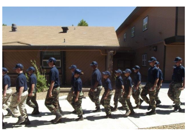
Marching as a Class