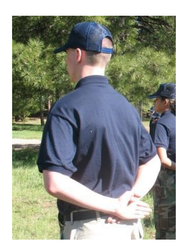
Parade-Rest Position (Rear View)