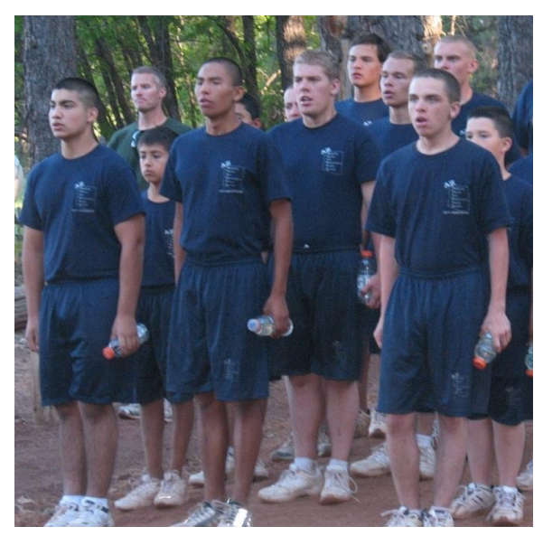
Standing at Attention (Front view)