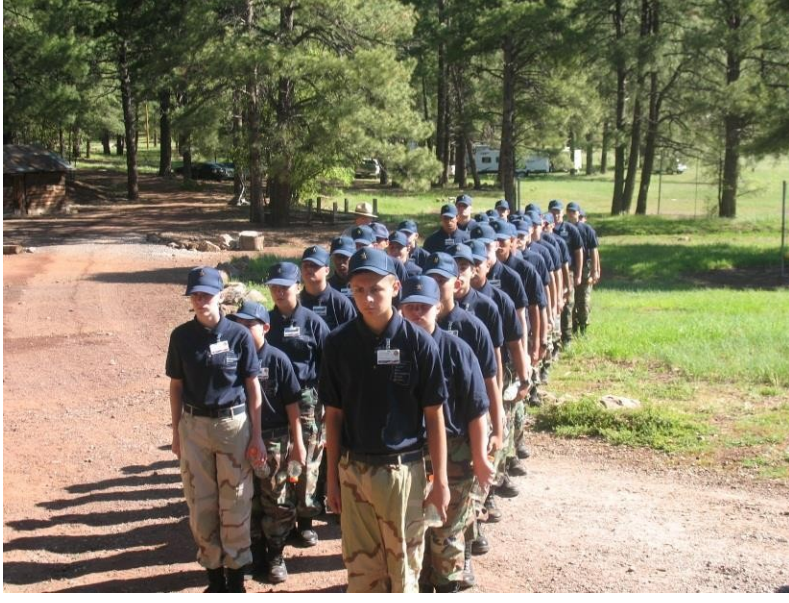
Two Column Class Marching