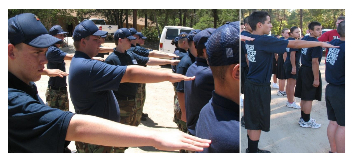
Alignment for Cover