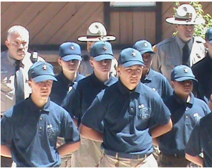
Parade-Rest Position (Front View)