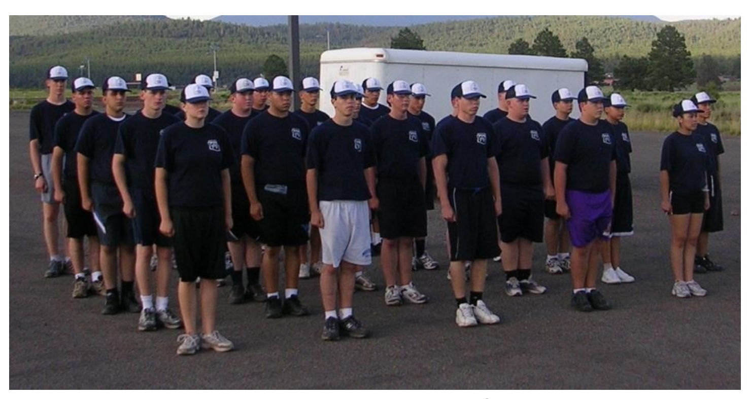
Reporting in Formation as a Class