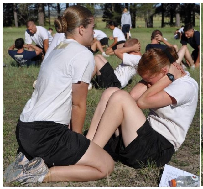
Sit-up Position (Up Position)