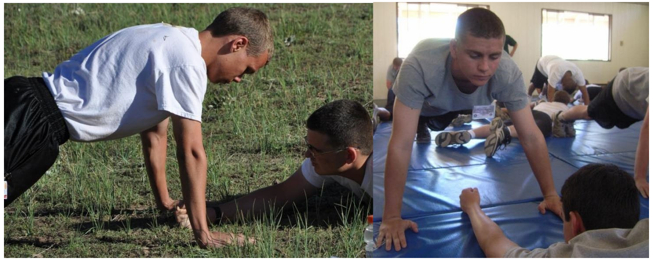
Front Leaning Rest Position-Up (Side View)