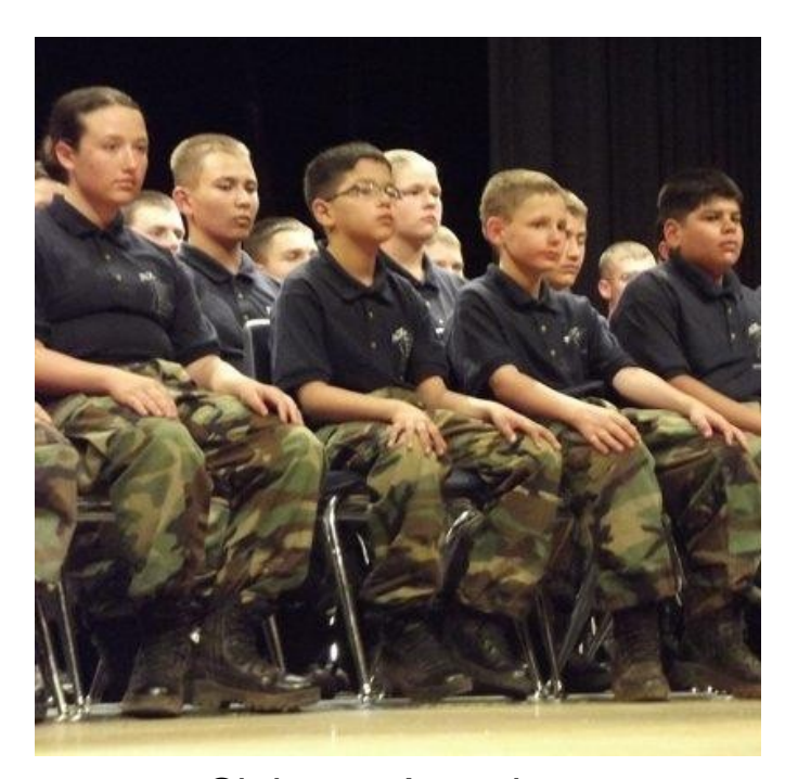
Sitting at Attention