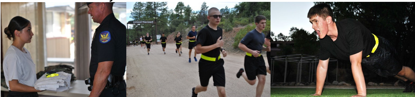
Section 1.19 Physical Fitness Conduct