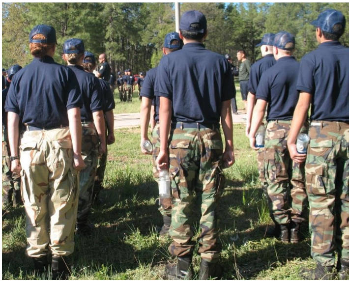
Standing at Attention (Rear View)