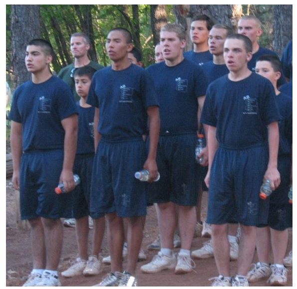
Standing at Attention (Front view)