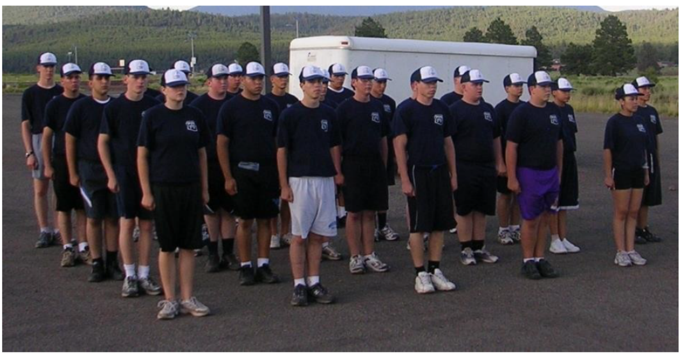
Reporting in Formation as a Class