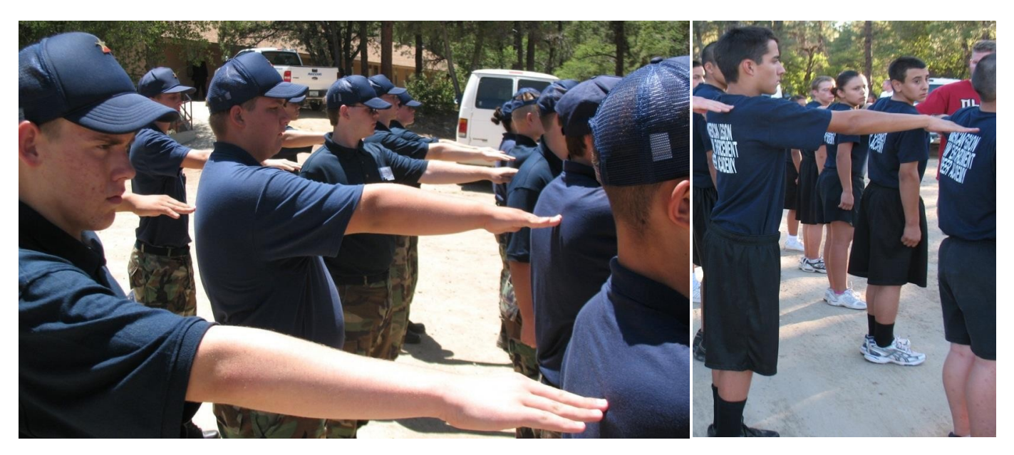
Alignment for Cover