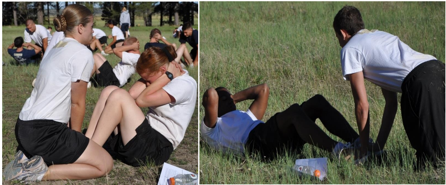
Sit-up Position (Up Position)