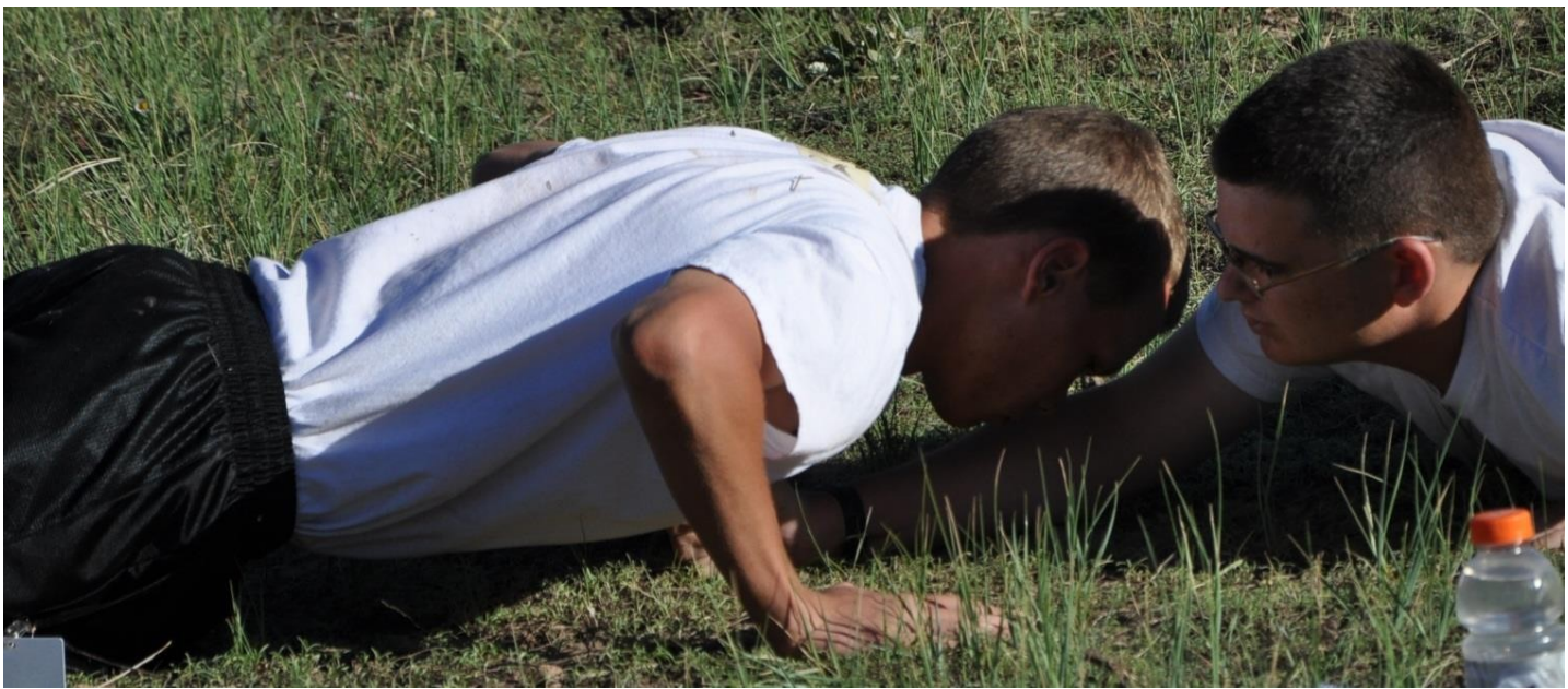
Front Leaning Rest Position-Down (Side View)