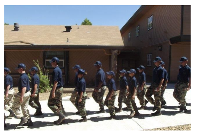
Marching as a Class