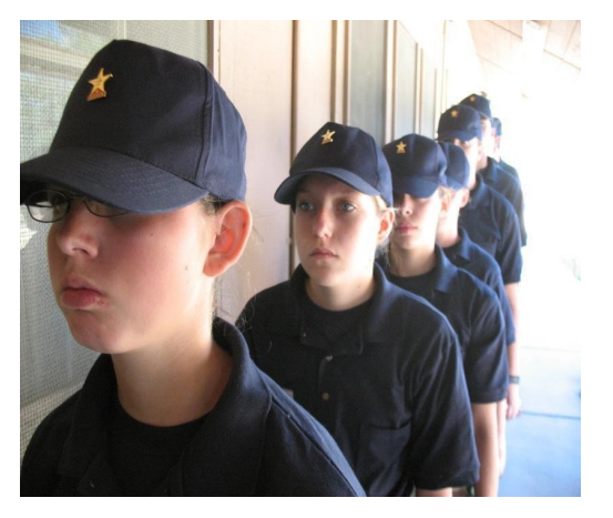
Single File Line