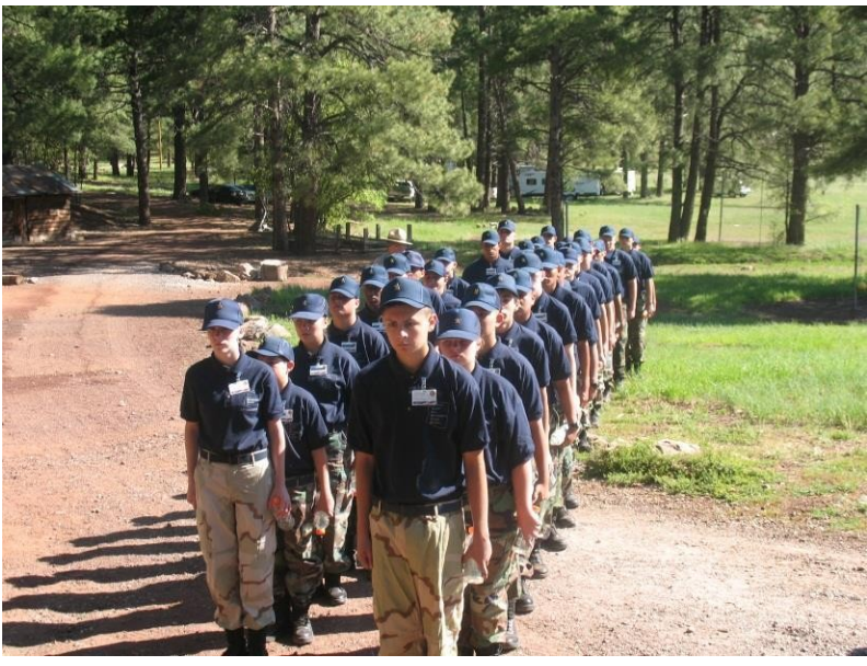
Two Column Class Marching