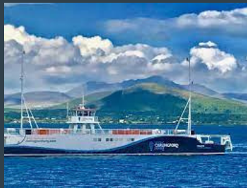
CARLINGFORD LOUGH FERRY

Scenic Ferry ride from Greencastle to Greenore