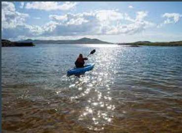
EAST COAST ADVENTURE