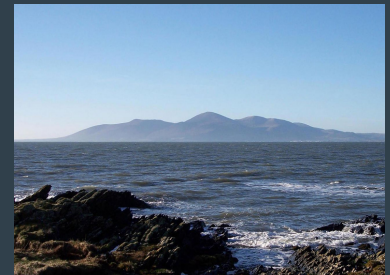
MOURNE SEA TOURS

Thrilling sightseeing boat trip in Newcastle Harbour