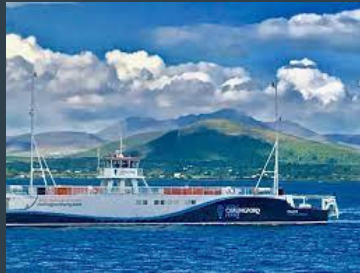
CARLINGFORD LOUGH FERRY

Scenic Ferry ride from Greencastle to Greenore