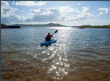
EAST COAST ADVENTURE