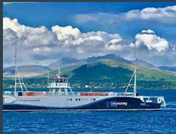
CARLINGFORD LOUGH FERRY

Scenic Ferry ride from Greencastle to Greenore