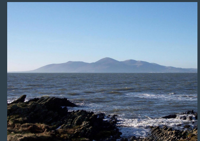
MOURNE SEA TOURS

Thrilling sightseeing boat trip in Newcastle Harbour