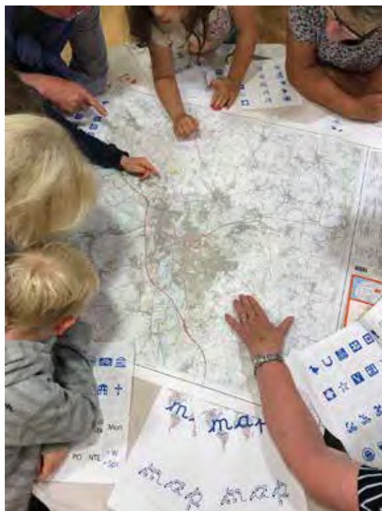
Symbol Spot at a Holiday Workshop