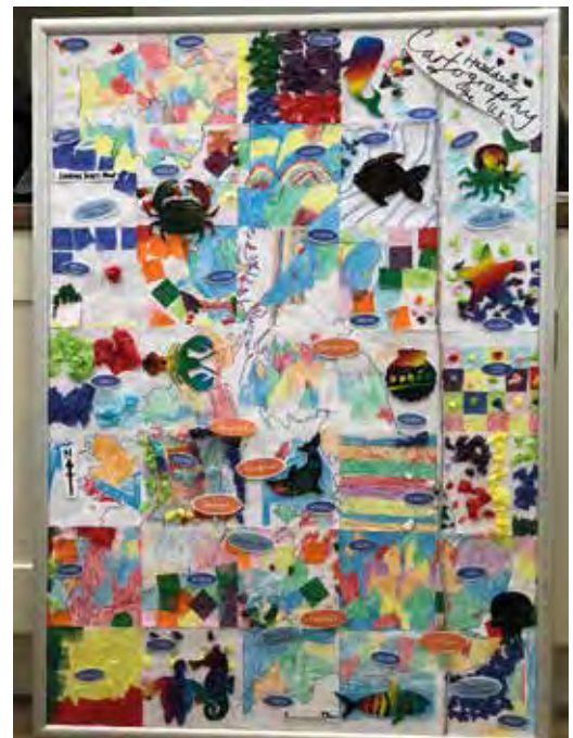
Imagery taken at Hazeldene School, Bedford for their SHINE DAY 2017