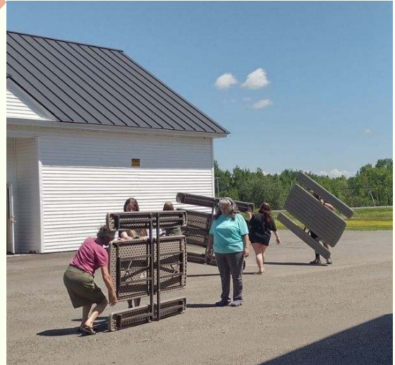
Students from Summit Academy helped with putting our picnic tables out in the yard, while they were touring. We appreciated the extra hands.

We hope some of our readers will consider helping us out this summer season. We have several jobs that we need help with: be a tour guide a few hours each week or once a month. One does not need to be a seasoned tour guide, you can just pop in on the tours to see if the guests have questions and lead them in the right direction to the next building. There are random computer projects and help with cleaning items to be put on display. We also need someone to clean the kitchen and common areas before and after our events. This would be about once a month. There are several things that need to be framed and maybe some outside painting. If you are interested in any of the tasks above please contact: Nancy Wright, 538-8905, Debbie Melvin, 538-9604 or Karen Donato 694-6099. Call Rae Johnston. 538-9402 to be added to our dessert list for suppers or to help with serving at our monthly suppers.