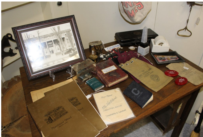
Northland Hotel items

We hope some of our readers will consider helping us out this summer season. We need you. Through the years we have lost many of our original volunteers through aging or health reasons. We have several jobs that we need help with: be a tour guide a few hours each week or once a month. One does not need to be a seasoned tour guide, you can just pop in on the tours to see if the guests have questions and lead them in the right direction to the next building. We also need someone willing to make sure the building is opened up and ready with supplies for a private function and locked with lights out at the end of the event. There are random computer projects and help with cleaning items to be put on display. There are several things that need to be framed, lawn mowing, maybe some outside painting, or organizing our repair room area. If you like to cook, please call Rae Johnston. 538-9402 to be added to our dessert list for suppers or to help with serving at our monthly suppers. If you are interested in any of the tasks above please contact: Nancy Wright, 538-8905, Debbie Melvin, 538-9604 or Karen Donato 694-6099.