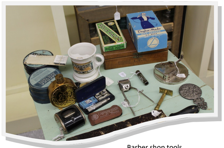
Barber shop tools