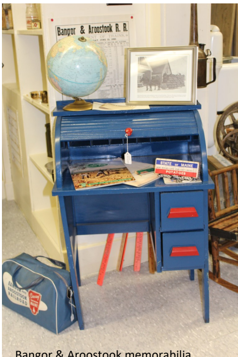
Bangor & Aroostook memorabilia