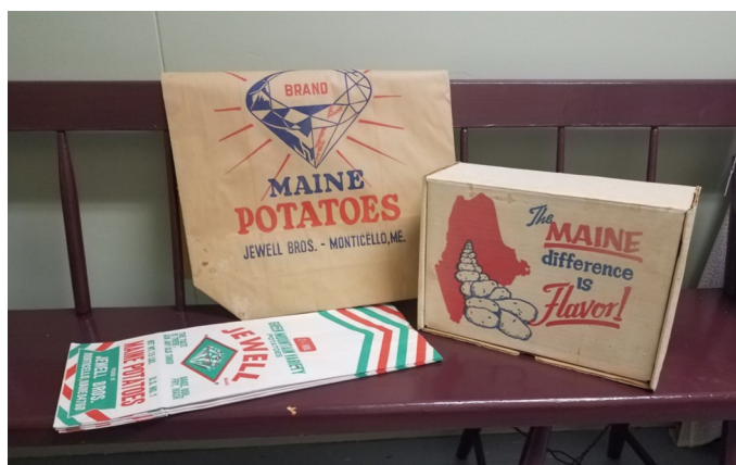
Items from Jewel Bros.in Monticello.