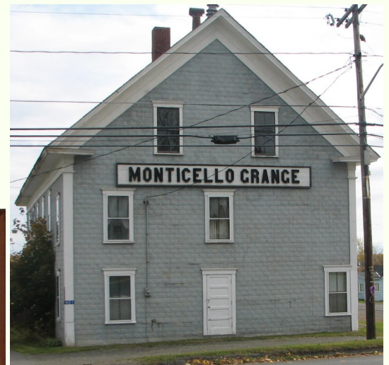
The Monticello Grange was torn down several years ago.