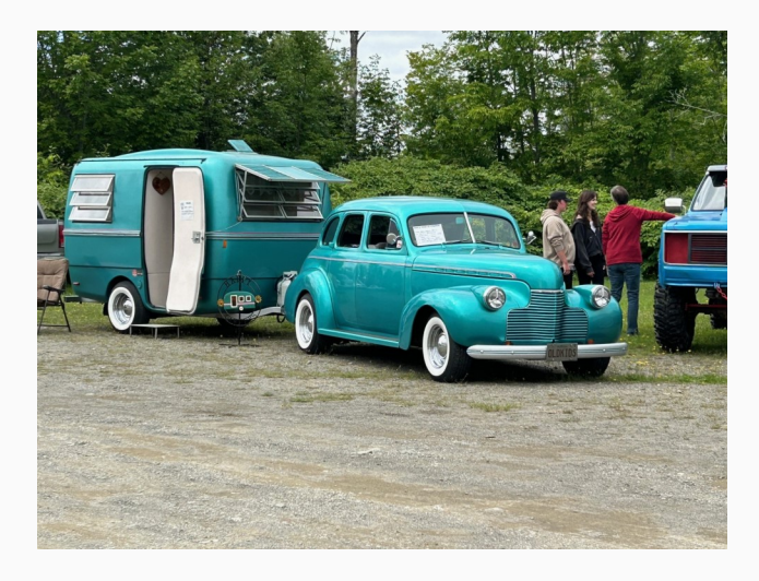
A cool ride at the annual North Country Classic Car & Truck Show.