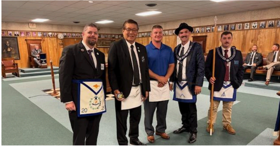
Amelia Lodge No. 47