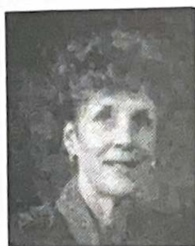
Ann Hodgson Hairstyles

I have been working with sound equipment within the community for the past three years. I would like to pursue a career in computer programming and sound.