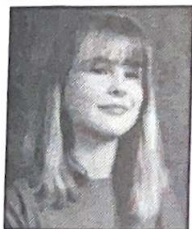
Celeste White Violin