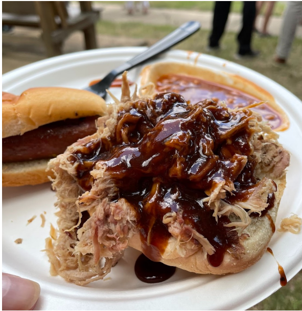
July 4th fun at Holmes Park

It was great seeing familiar faces again, as well as having the opportunity to finally meet the people who joined the neighborhood during the pandemic!