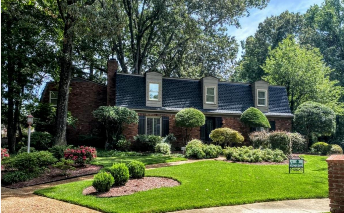
September Linda Bourgeois 6828 Talisman Cove