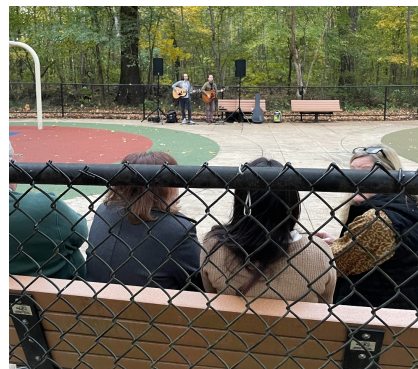
Church Brothers Performing at National Night Out.