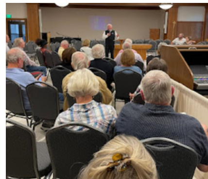
Neighbors Gather for the First Annual Meeting since January 2020.