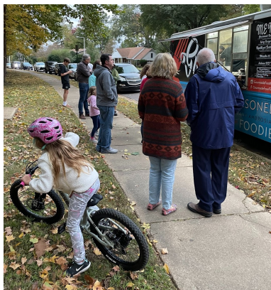
National Night Out Featured Food Trucks and Music.