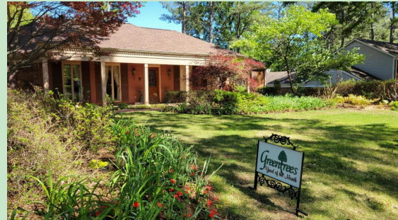
May: Syble Kindig, 2036 Black Oak Drive