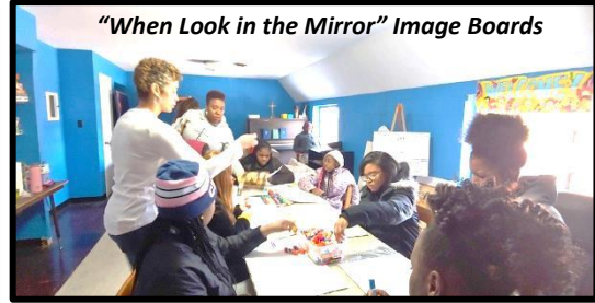
"When Look in the Mirror" Image Boards