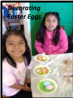
Decorating Easter Eggs