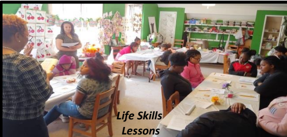
Life Skills Lessons