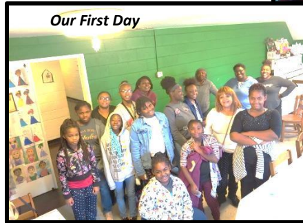
Our First Day