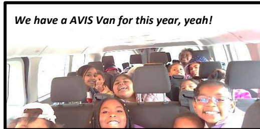
We have a AVIS Van for this year, yeah!