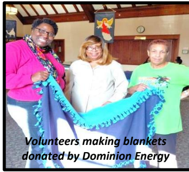
Volunteers making blankets donated by Dominion Energy