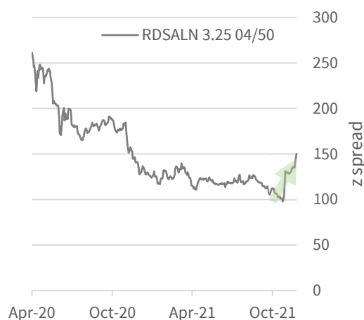
Figure 1. RDSALN 30yr bonds widening last month.

Given Shell's stated ambitious (net zero) transition strategy, we are concerned to see such a project in play and keen to understand how this fits in the strategy. While awaiting such clarity, we retain our underweight stance on the old as well as the new long-end USD bonds. This project runs the risk of being counter-productive towards net zero goals considering recent evidence that whales may be one of the more efficient and practical Carbon Capture and Storage (CCS) mechanisms. 2