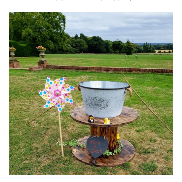
Hook A Duck £25