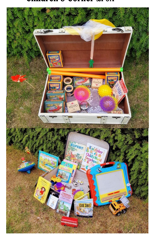
Children's Corner £POA