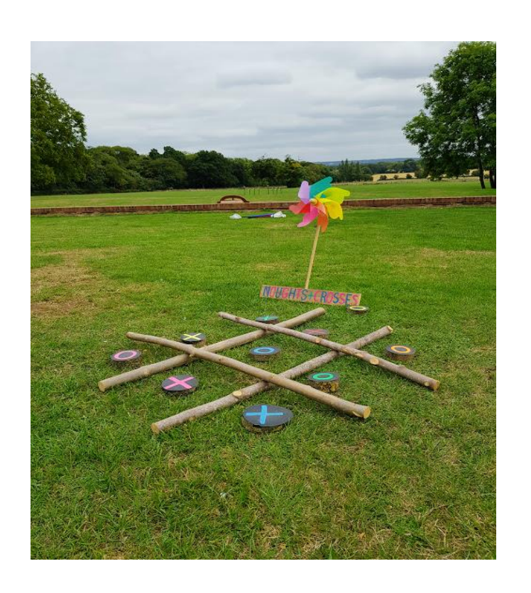
Rustic Noughts & Crosses £25