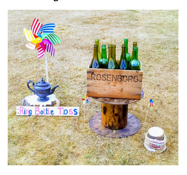
Ring Bottle Toss £25