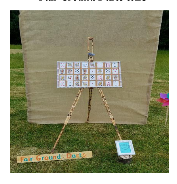
Fair Ground Darts £25