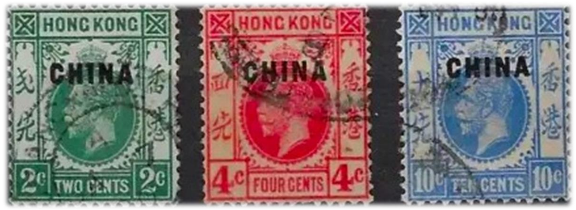
British Offices Abroad – China, Scott #'s 2; 3; 6

Hong Kong postage stamps overprinted "CHINA" in black are listed in most catalogues under British Offices Abroad . Similar to office abroad issues of other European powers, these stamps reflected extraterritorial privileges, but here there is a big difference. These stamps were used in a British colony!