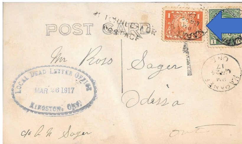
To the DEAD LETTER OFFICE. 1c Excise Tax stamp used to pay 1c War Tax March 24, 1917