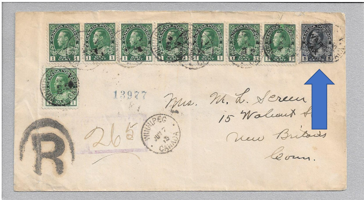
Registered cover from Winnipeg, Canada to New Britain, Connecticut, USA June 7, 1915. 5 cents Wine Tax excise stamp.

This 5c WINE TAX stamp was only valid for 750ml bottles of wine and valid only for one day: FEBRUARY 12, 1915. Yet, here one is nestled together with eight 1c Canadian postage stamps, and passed through the mail to New Britain, Conn. on JUNE 7, 1915! The Post Office Department never had possession of these tax stamps!