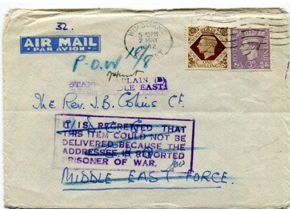
Figure 1: Mailed 2 May 1942 Wimborne, Dorset, UK

I am not much of a collector of World War II philatelic material, unless it is really important, and catches my attention. That said, this past November I had the opportunity to bid on a unique historical cover (Figure 1) 1 . It caught my attention in several ways, but most important was the notation “It is regretted that this item could not be delivered because the addressee is reported Prisoner of War” (POW). The addressee was a Staff Chaplain assigned to the British Middle East Force (M.E.F.) fighting in Palestine. Unfortunately, after very spirited (and high) bidding, I came in second place. Thus, I am left with just the scans of the front and back (Figure 2) 1 of this cover to consider.