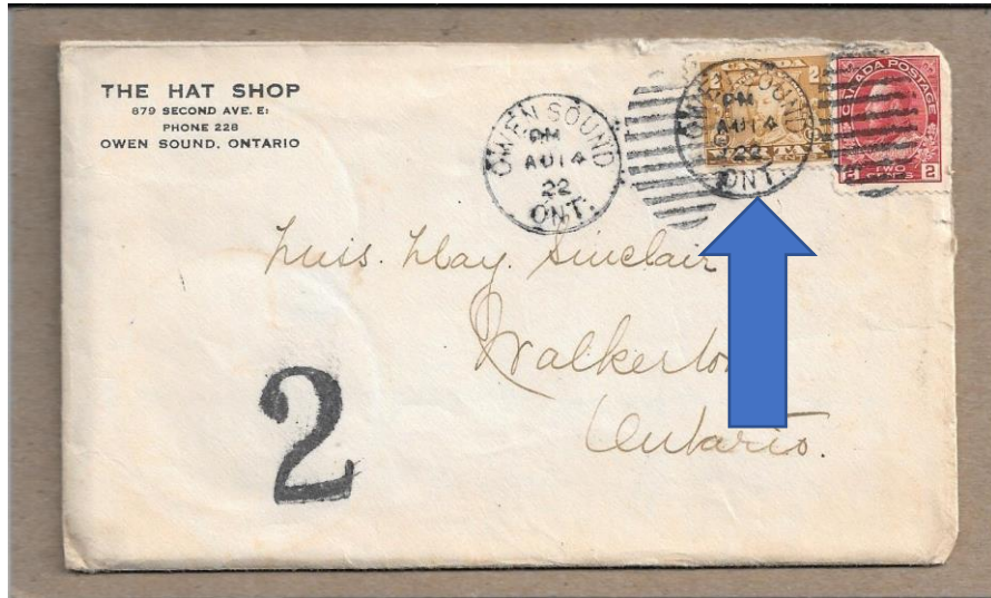
1c Excise Tax stamp used to pay 1c War Tax assessed twice the deficiency