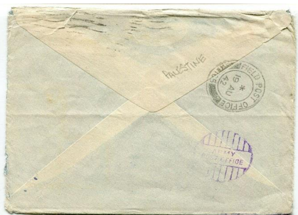
Figure 2: Received 19 August 1942 Palestine British Field Post Office

This cover arrived for the Chaplain on 19 August 1942 (backstamp receiving mark), and sadly, the notation on the front of the cover states “P. O. W. 18/8”, meaning 18 August 1942. He was taken prisoner the day before the letter for him arrived!