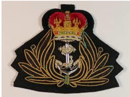
ROYAL NAVY CHAPLAIN CREST