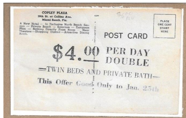
Figure 2: Reverse