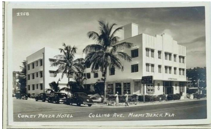
Figure 3 showing military personnel

The historic preservation report also discussed that the Copley Plaza (Figure 3) was one of 45 hotels/apartments in what has become a Historic District of Miami Beach to be leased by the military during World War II. Copley Plaza specifically was used for returning combat veterans to spend two-to-three weeks of "R&R" while their pay was calculated, records processed, and they were either discharged or reassigned. Many of these returnees had been missing in action or prisoners of war. On December 29, 1945 the Pancoast was the last of the military hotels to be returned to civilian use.