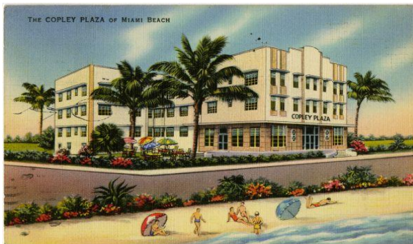
Figure 1: Front

Depicted on the post card is the Copley Plaza (Figure 1), located at 3900 Collins Avenue, Miami Beach, Florida. Since the postcard was used for advertising purposes, it was difficult to determine when the card was produced or much other than its address, that it is an Art Deco hotel, based on the image and the address, and that it was old, from the advertisement: $4.00 per day for a double room (Figure 2). A quick google search lead me to the ordinance in the Collins Waterfront Historic Designation Report adopted January 31, 2001 by the city of Miami Beach designating the area as an historic district. After reading the extensive report, I learned that the Copley Plaza was built in 1940, it confirmed that it was Deco architectural style, that it contributed to the historic district, and the architect who designed it was Albert Anis.