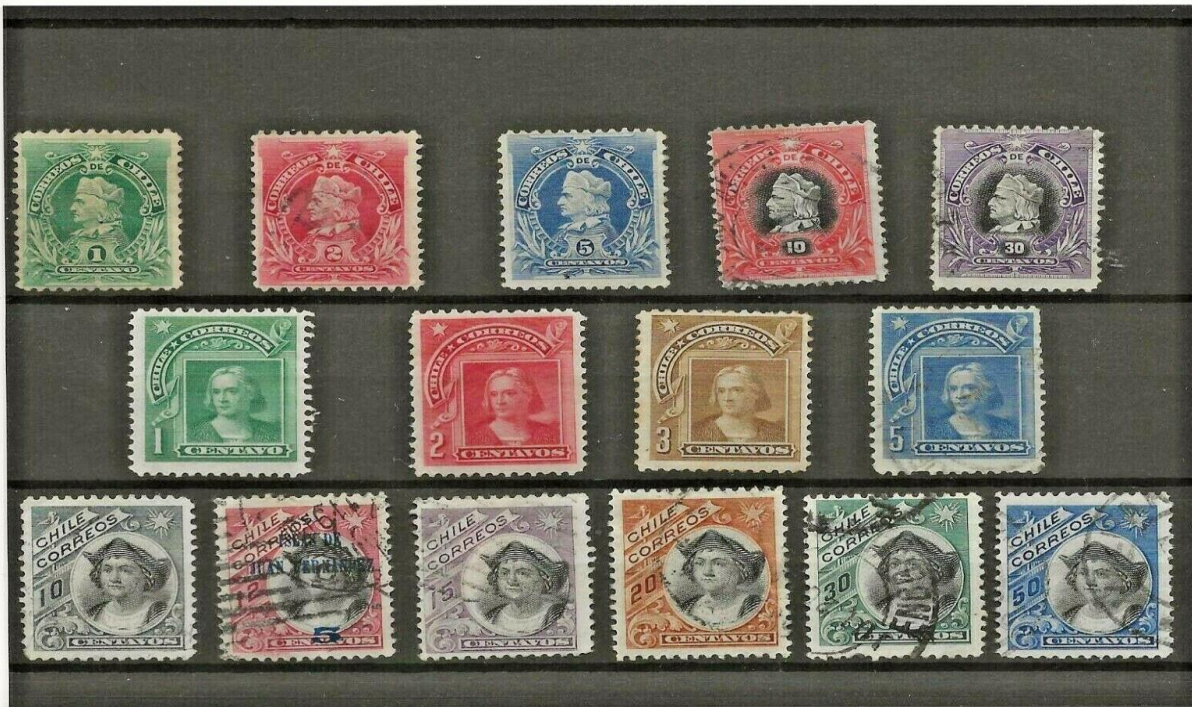
Figure 1: 1901-1905 Definitives. Columbus, Columbus, Columbus, etc, etc, etc

Since the first issue of 1853, almost every stamp of Chile had carried a portrait of Christopher Columbus (Figure 1), which is weird because Columbus never visited the country, nor even saw the Pacific Ocean. But the 1910 issue was the strangest of all.