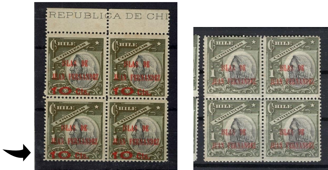
Figure 2a & b Scott # 80 with surcharge “10 cts”

British privateer Alexander Selkirk had lived as a castaway for four years, and had been the bases for the novel by Daniel Defoe in 1719. Collectors would pay “big bucks” for these stamps.