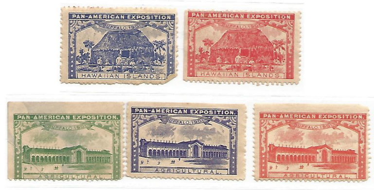
These five labels are of the same design.

Advertising was done in advance of the Expo and two examples of such advertising by stamp-like labels are shown below. The city of Buffalo or the state of New York may have created them.