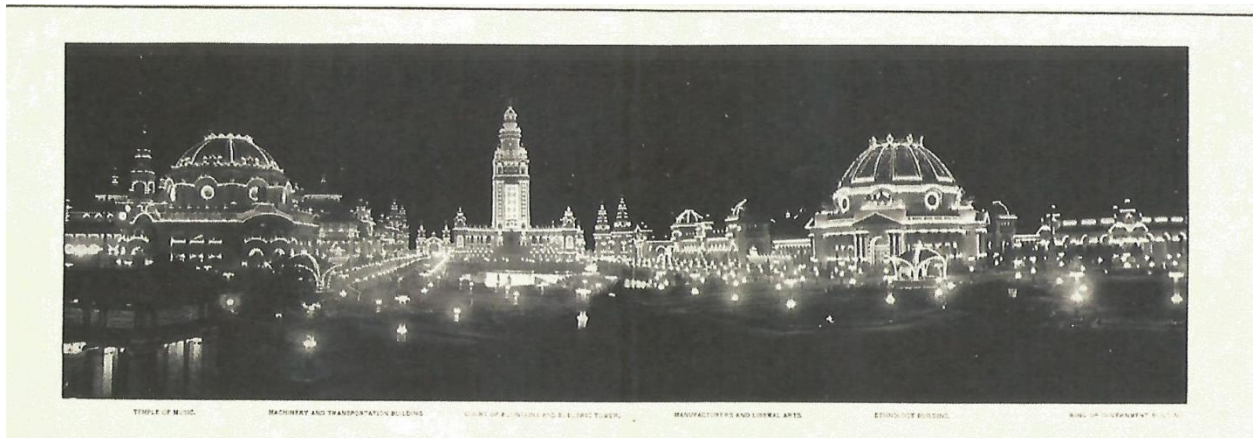
Nighttime view of Pan American Expo

The advent of the alternating current power transmission system in the US allowed designers to light the Exposition in Buffalo using power generated 25 miles (40 km) away at Niagara Falls.