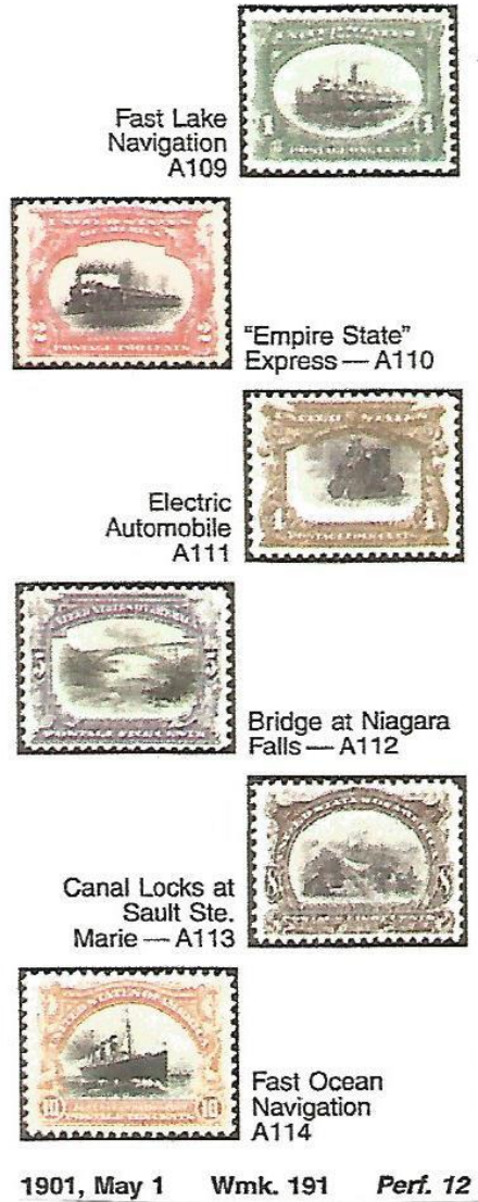
Scott # 294-299

The US government did its part in advertising the Pan Am Expo by the issuance of special stamps announcing the exposition. Six stamps were issued on the 1 May 1901 opening day as shown below. We know them today as Scott # 294 to 299. A special printing of Scott # 296a with an inverted center was also made. Scott values this inverted issue today at $35,000.00. Other inverts are known.