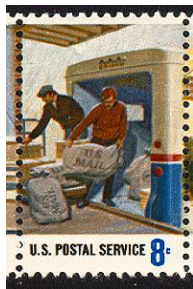
Loading Truck: Sc# 1496 “Thirteen billion pounds of mail are handled yearly by postal employees as they speed your letters and packages. People Serving You.”