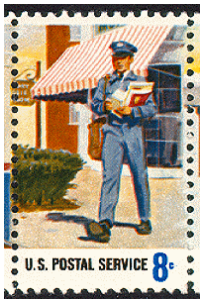
Letter Carrier: Sc# 1497 “Our customers include 54 million urban and 12 million rural families, plus millions of businesses. People Serving You.”