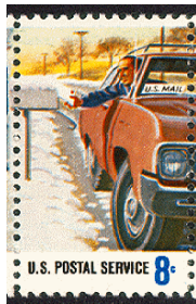
Rural Delivery: Sc# 1498 “Employees cover 4 million miles each delivery day to bring mail to your home or business. People Serving You.”