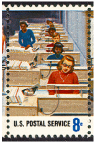
Machine Sorting: Sc# 1495 “Employees use modern, high speed equipment to sort and process huge volumes of mail in central locations. People Serving You.”