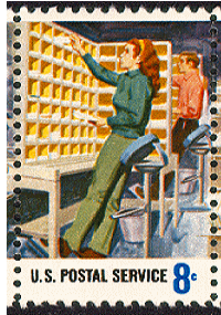
Manual sorting: Sc# 1494 “The skill of sorting mail manually is still vital to the delivery of your mail. People Serving You.”