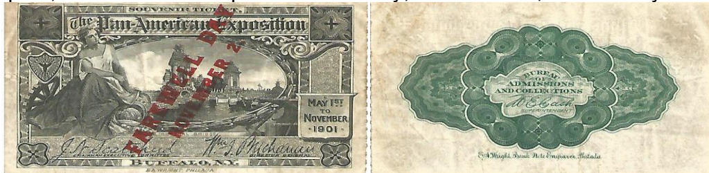
Expo Admission Ticket for last day