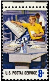
Mail Canceling: Sc# 1493 “Thousands of machines, buildings, and vehicles must be operated and maintained to keep your mail moving. People Serving You.”