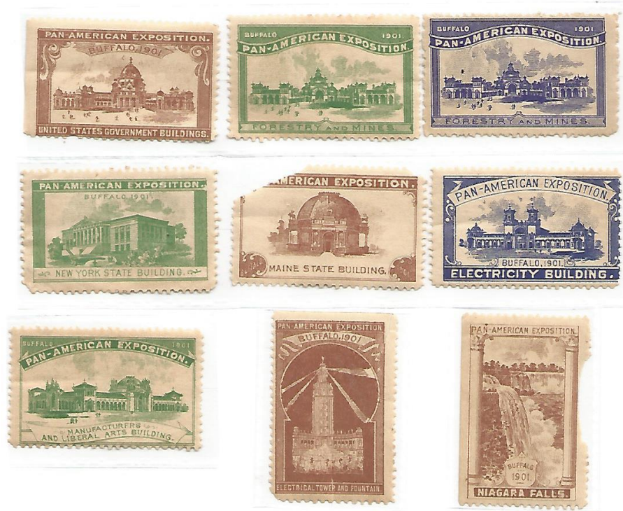
There are eight different labels in this group.