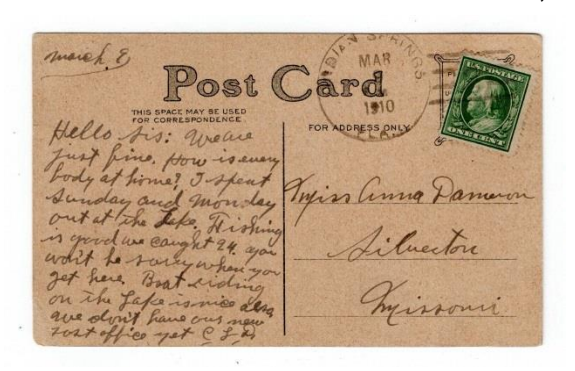
Samsula Post Office remained in service until Indian Springs 1910 September 30, 1936, after the FEC spur transporting their mail was discontinued.

After the entire settlement, including its hotel and post office at adjacent Indian Springs, burned in January 1931, the mail was redirected to Samsula and merged into a wooden two-story structure at the intersection of Samsula Drive and the railroad. The Samsula Post Office remained in service until