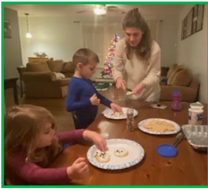
Lutz Family making cookies