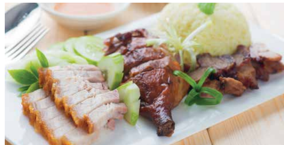
All images are for illustrational purposes only.

Peasant Hot Pot .....£17.00 Mixtures of Meat, Seafood with Glass Noodles & Vegetables