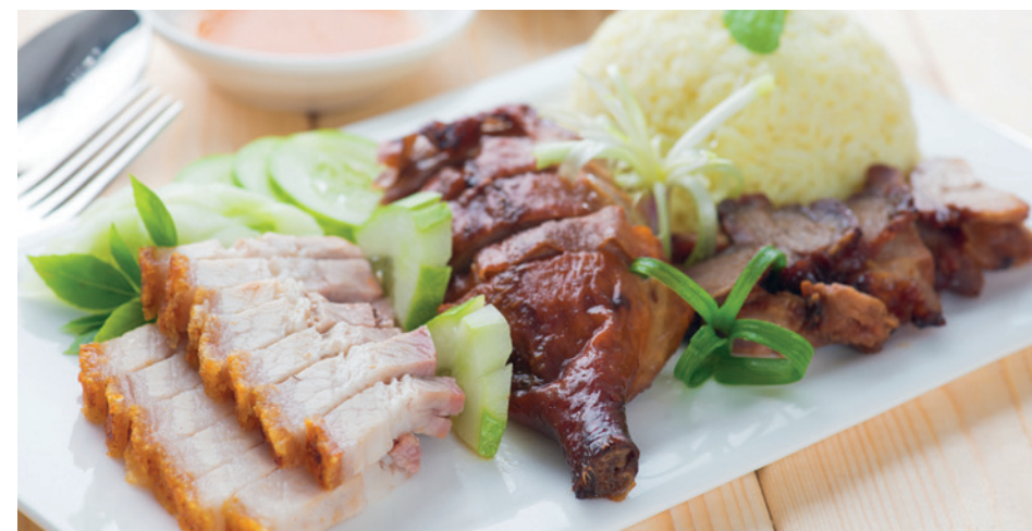
All images are for illustrational purposes only.

Peasant Hot Pot .....£16.00 Mixtures of Meat, Seafood & Pork Liver with Glass Noodles & Vegetables