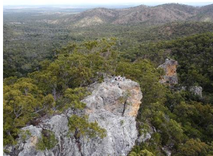
Pinnacle 3 with Pinnacle 2 and 1 in background